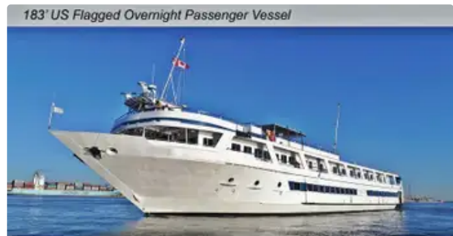
183' US Flagged Overnight Passenger Vessel